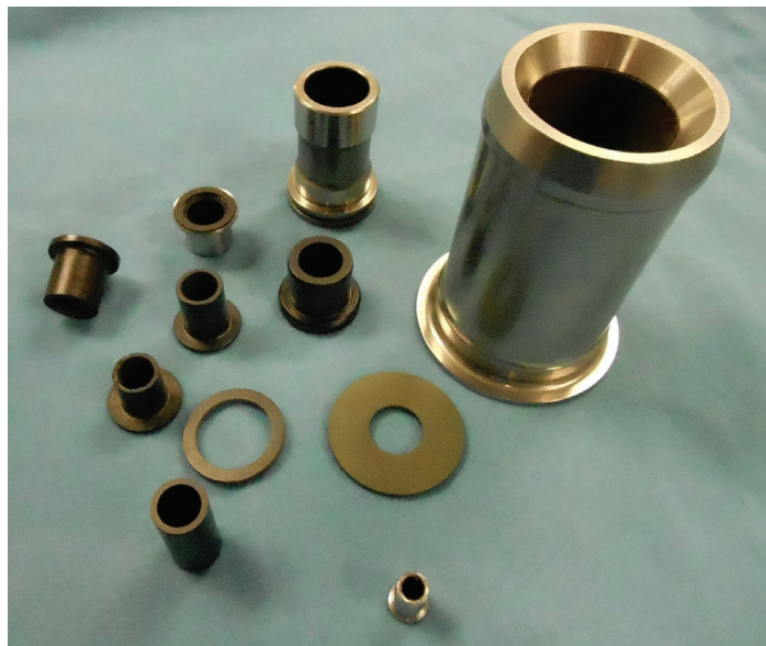
Figure 1. DuPont Vibratory Rig Wear; 475 °F/25 hr/55 lb